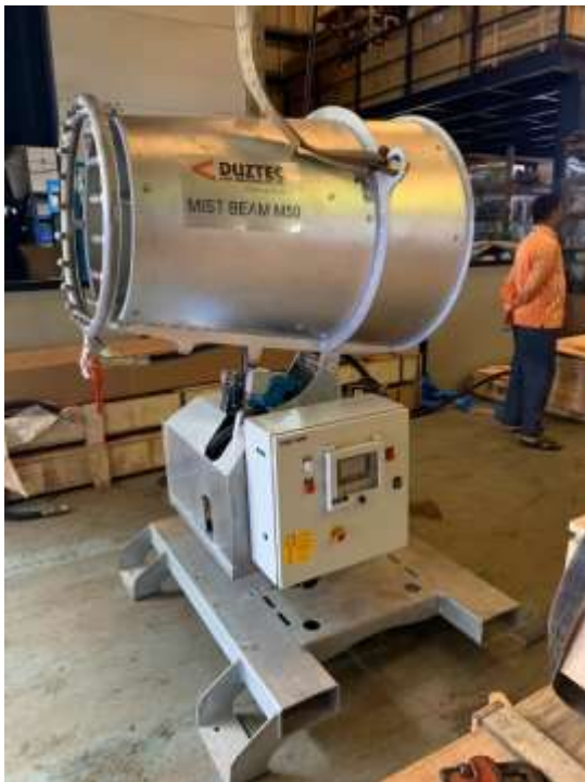
Mist Beams (MB)