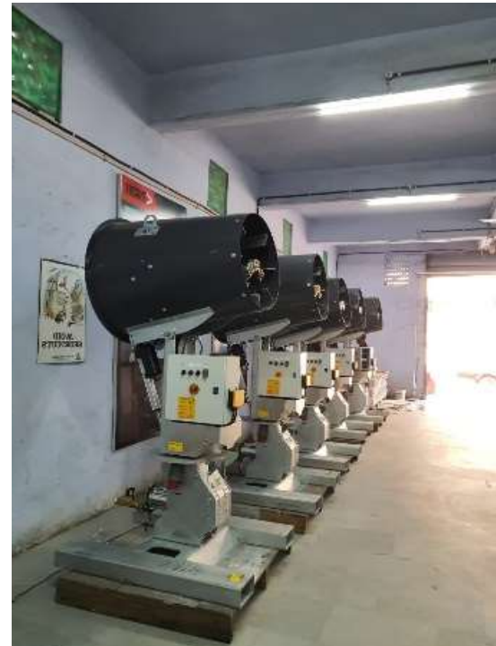
Mist Cannons (MC)